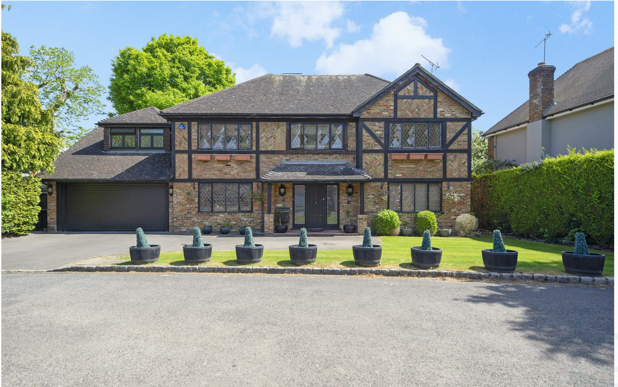
Greenoak Way, Wimbledon Village, SW19 5EN